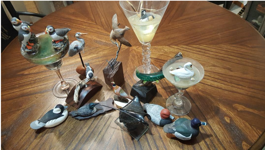
SAMPLES OF COCKTAIL CARVINGS

persuaded some of your instructors and other members to donate some items for the Xmas party.